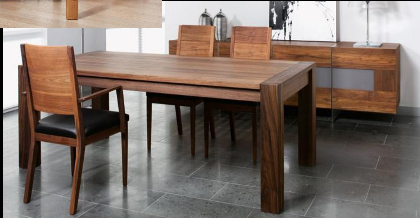
“Fugatum” – Mfg. Scholtissek