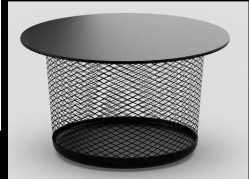
"AP-Stool – Mfg. LaPalma