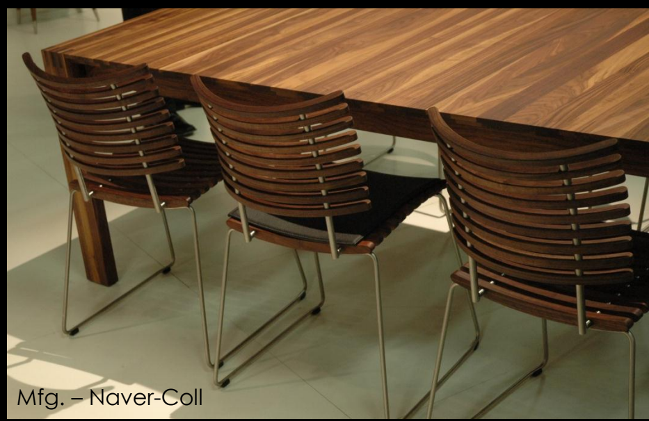
Mfg. – Naver-Coll