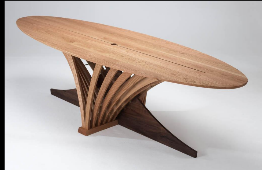
Prize Winner – Hay Festival - UK