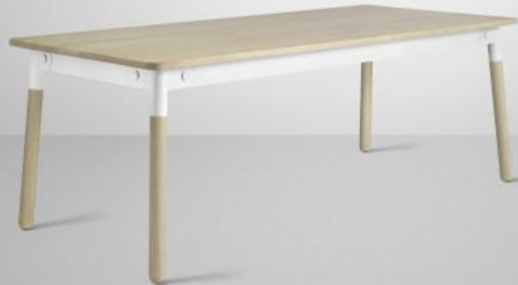
“Adabtable” – Mfg. Muuto