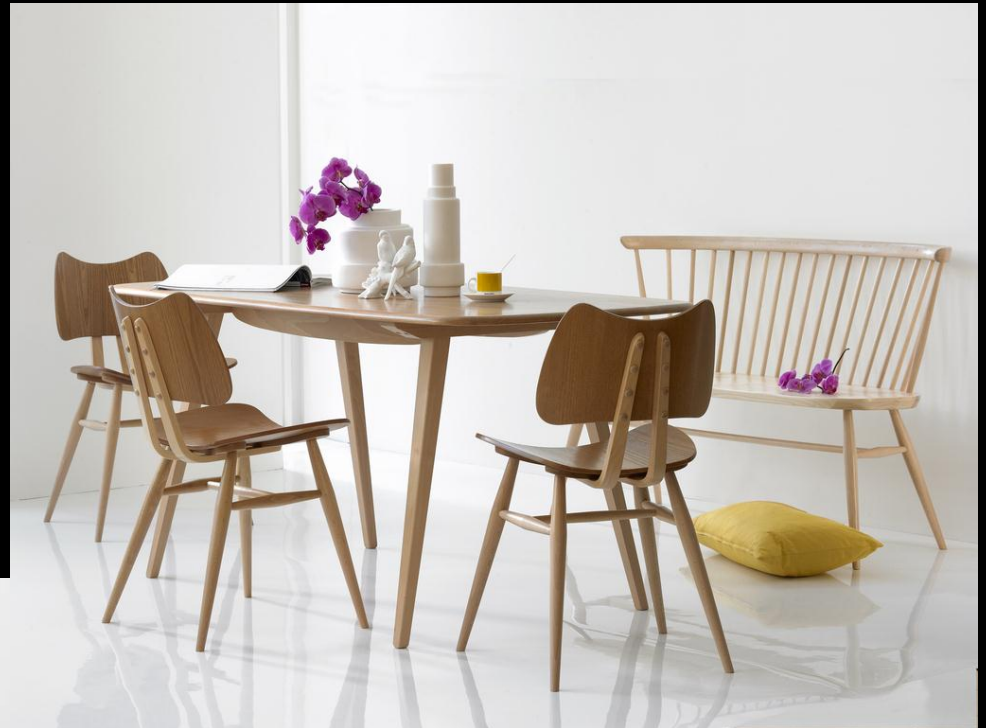
“Red Elm” – Mfg. Ercol