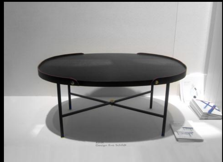
RTM Design Ernst Schlot