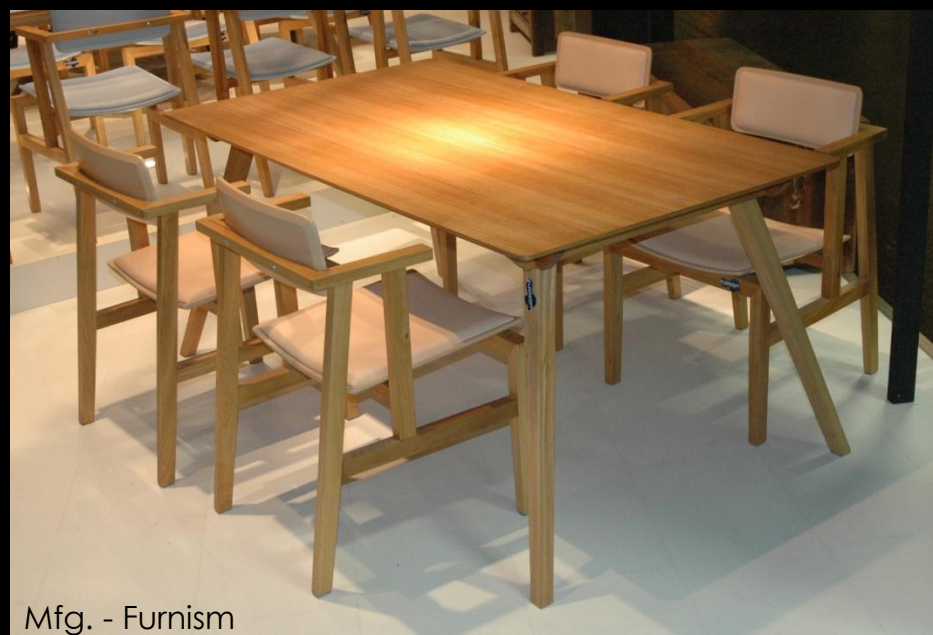
Mfg. - Furnism