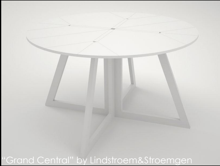
"Grand Central" by Lindstroem&Stroemgen