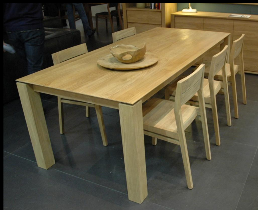
Mfg. – Ethnicraft