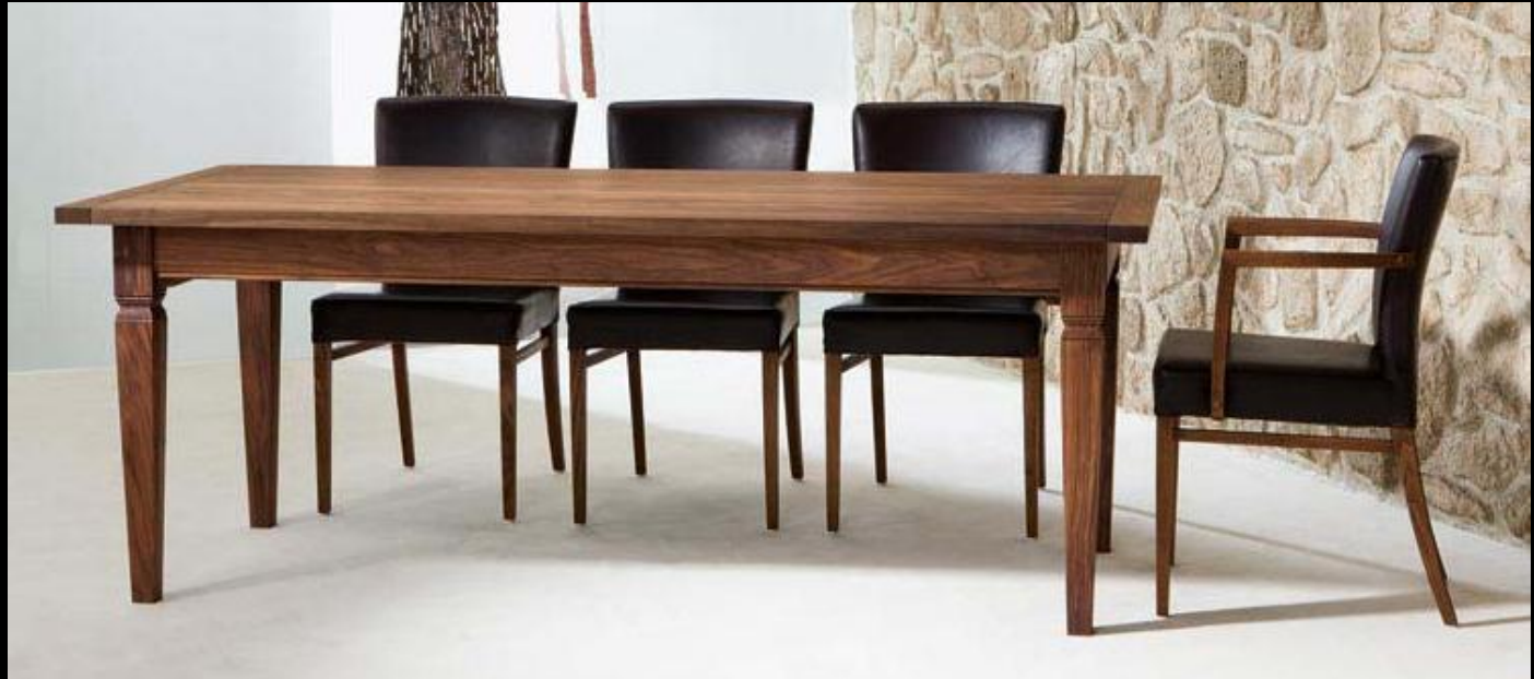
“Imp. Quintum” – Mfg. Scholtissek