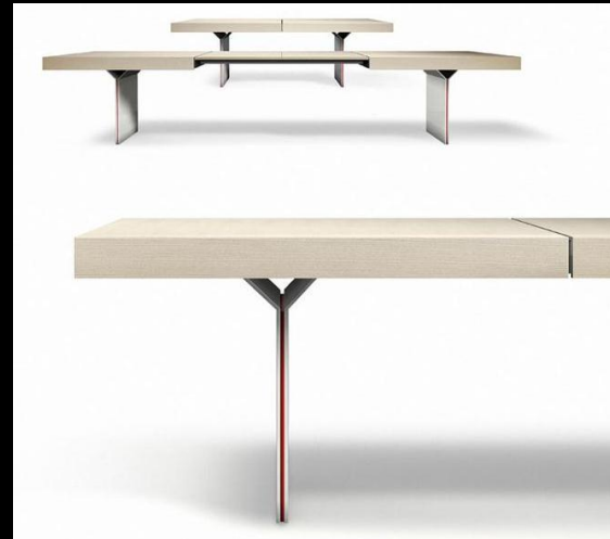
Two tables by Enzo Berti for Bauline