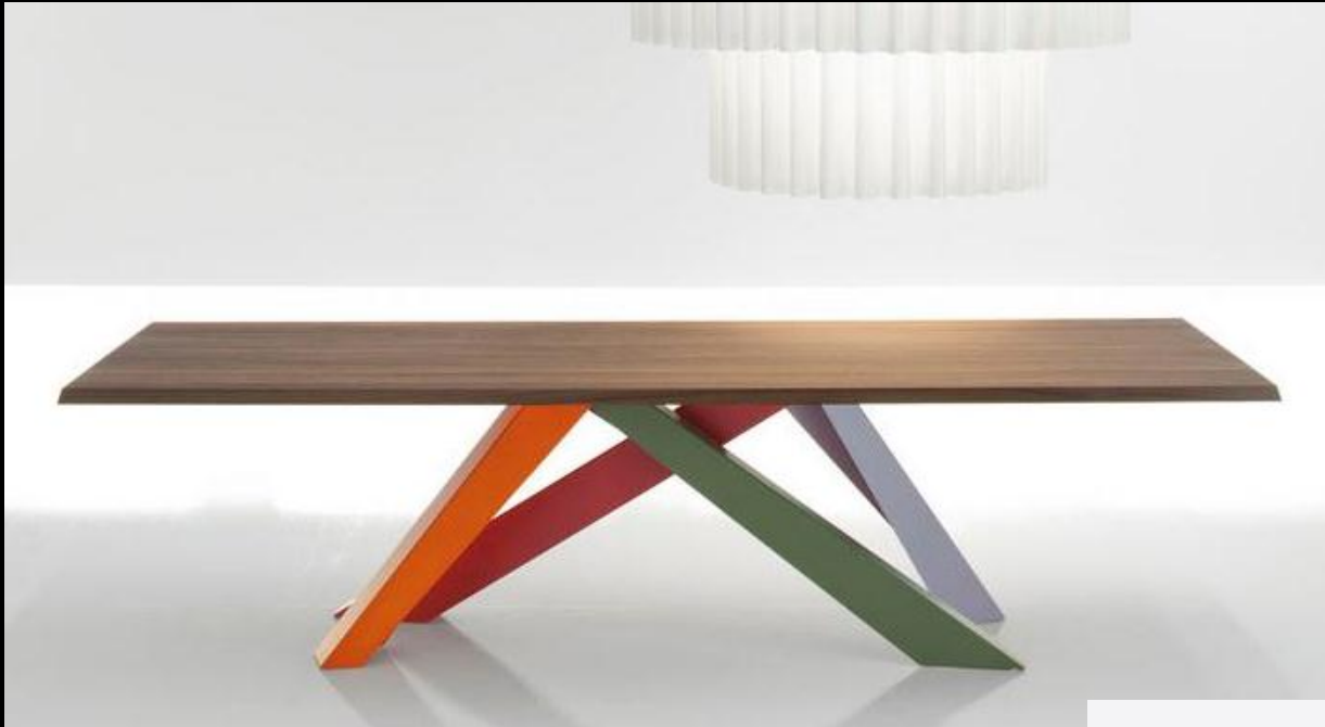
“Big Table” by Alain Gilles for Bonaldo