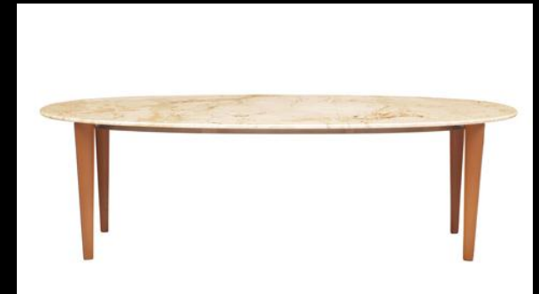
"Oval" by Enzo Mari for Hermès